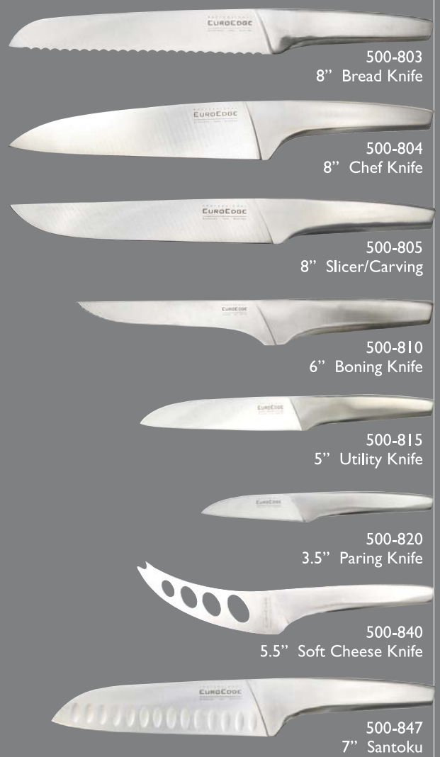
500-803 8" Bread Knife