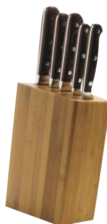
808-357 Portland 5pc Red Pakka Knife in Trapezium Bamboo Block