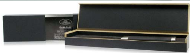
• Each piece per Deluxe Wooden Box