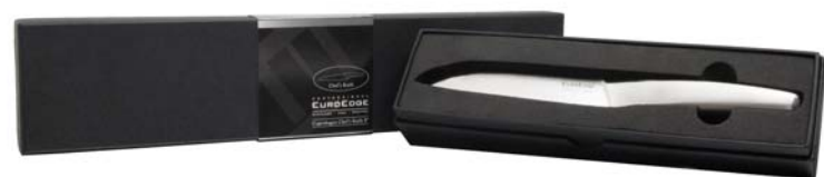
• Each Piece per Black Ridge Paper Box