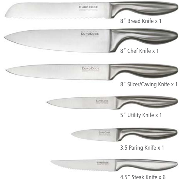
8" Bread Knife x 1