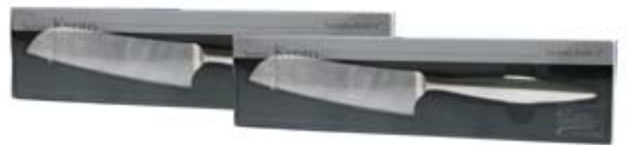
• Each Piece per PET Acetate Box