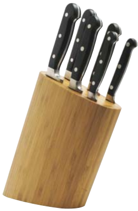
825-162 Berlin 6 pc. POM Handle Knife Set with Storage Block in Natural Bamboo