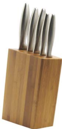
310-357 Kyoto 5pc Hollow-Handle Knife in Trapezium Bamboo Block