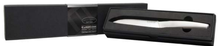
• Each Piece per Black Ridge Paper Box