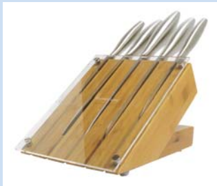
310-456 Kyoto 5pc Hollow Handle Knife Set with Designed Bamboo/Acrylic Block