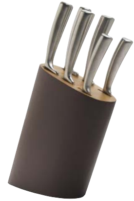
510-166 Barcelona 6 pc. Hollow Handle Knife Set with Storage Block in Coffee Brown Colour