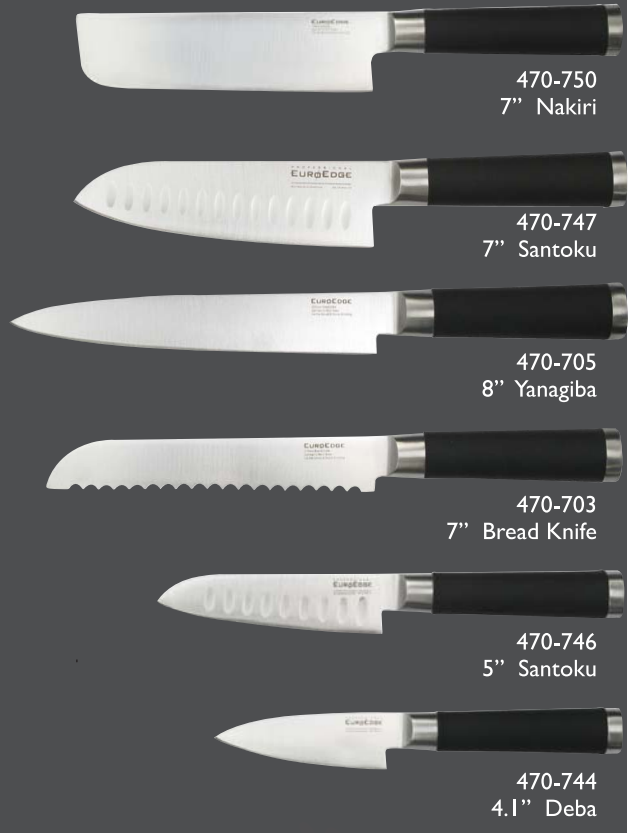
470-750 7" Nakiri