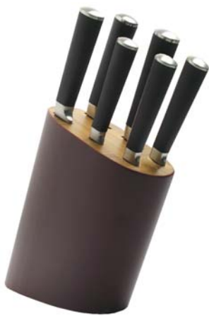
585-168 St. Louis 6 pc. Soft TPR Handle Knife set with Storage Block in Elegant Burgundy Colour