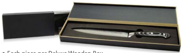
• Each piece per Deluxe Wooden Box