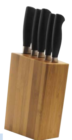
915-357 Hamburg 5pc Solid POM Knife in Trapezium Bamboo Block