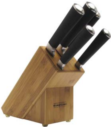
585-556 St. Louis

5pc Soft Grip Handle Knife Set with Bamboo Block