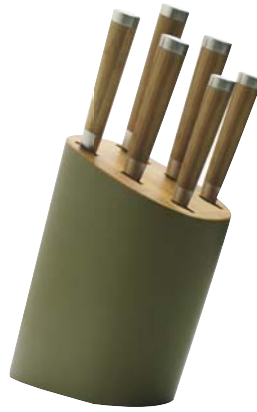
472-164 Hiroshima 6 pc. Bamboo Handle Oriental Knife set with Storage Block in Prevailing Green Colour