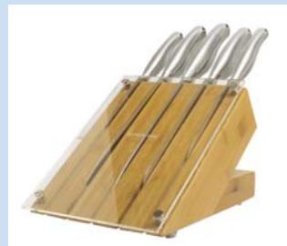
345-456 Kobe 5pc Hollow Knife Set with Designed Bamboo/Acrylic Block