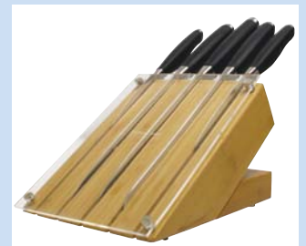
360-456 Nagoya 5pc Soft Grip Handle Knife Set with Designed Bamboo/Acrylic Block