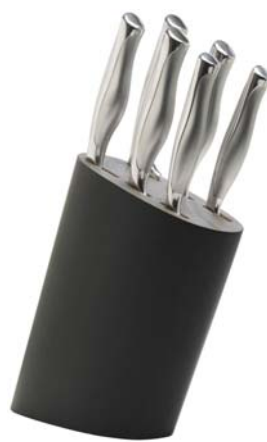
345-160 Kobe 6 pc. Hollow Handle Knife Set with Storage Block in Dark Black Colour